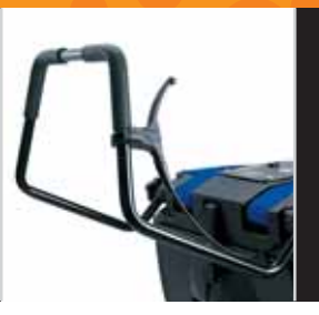
Adjustable ergonomic drive handle to match operator height. Foldable for easy transport.